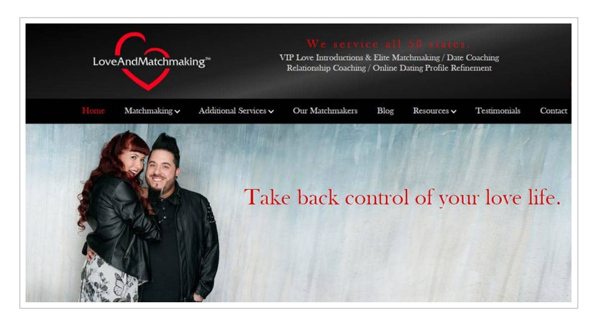
Love and Matchmaking promises to end the swiping and get straight to the matching.

"Finding a match isn't just about height, age, and location," Rachel explained. "We're dealing with a million and one different factors."