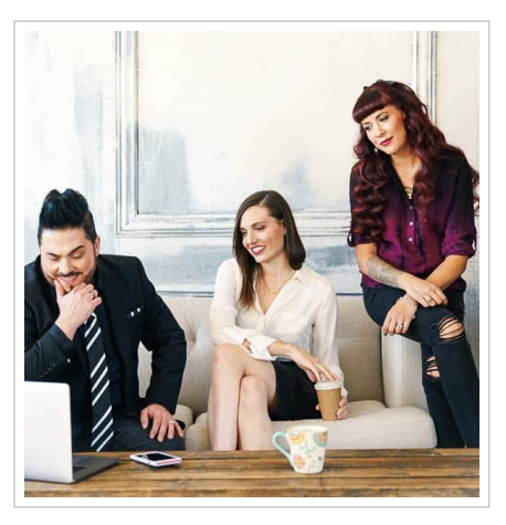
Since 2011, Love and Matchmaking has been a guiding light for singles in search of love and happiness.

Love and Matchmaking has the experience and connections to help singles find the perfect match, and its work has been life-changing and loveaffirming for singles of all stripes.